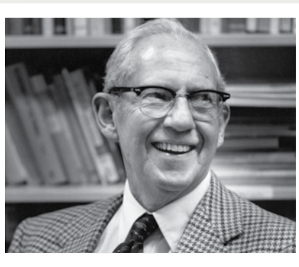
George J. Stigler (1911-1991), PhD'38, the Charles R. Walgreen Distinguished Service Professor of American Institutions (apf1-13366)